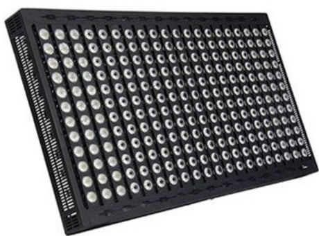
NorthLED Ligalight 3000 A3

LED Ligalight fixtures are developed for outdoor lighting of larger areas. The technology is patented and developed in a collaboration between NorthLED and the Technical University of Denmark, Department of Photonics Engineering.