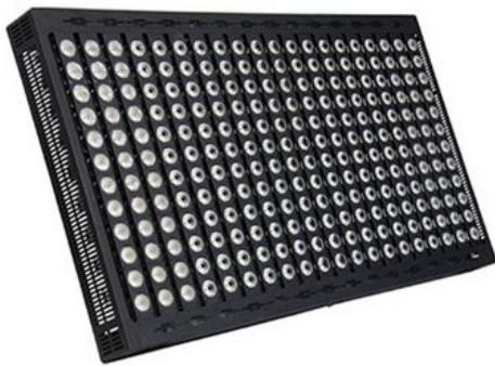
NorthLED Ligalight 5000 A3

LED Ligalight fixtures are developed for outdoor lighting of larger areas. The technology is patented and developed in a collaboration between NorthLED and the Technical University of Denmark, Department of Photonics Engineering.